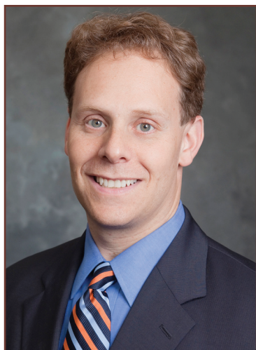
by Max W. Cohen, MD, FAAOS

You pick up a box off the ground, turn to the side and place it in your car. Ouch! You feel a sharp pain in your lower back. The pain is still there a few hours later. What's up?